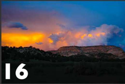
16 11.8 mi On the right: Beautiful sunsets and night skies