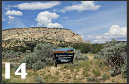
14 11 mi Grand Staircase Escalante, the canyon to Montezuma's Cave