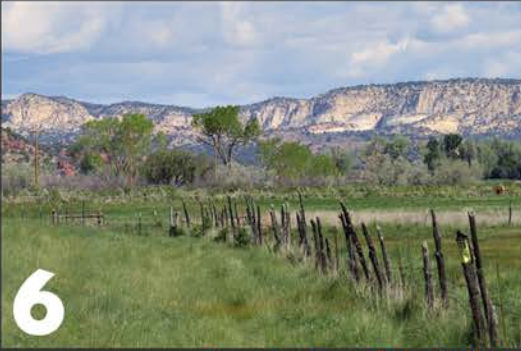
6 Great view of the White Mountains