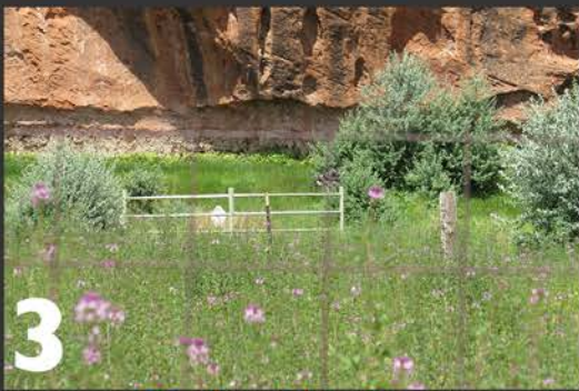
3 3.6 mi On the right: Pioneer grave