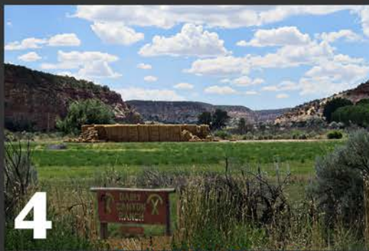
4 5.4 mi On the left: Dairy Canyon