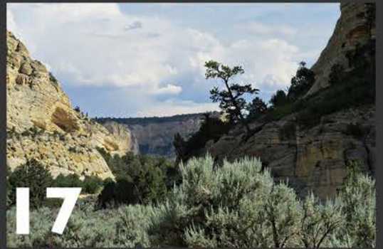
17 15.4 mi The right: End of pavement, beginning of backcountry adventure