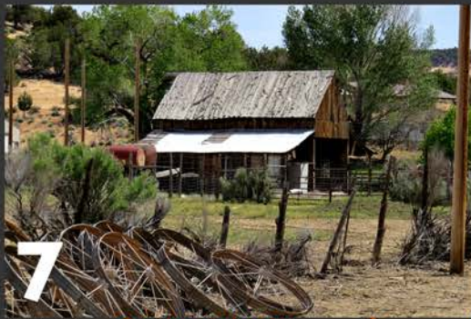
7 5.5 mi On the right: Pioneer farm and equipment