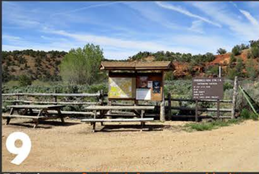
9 7.5 mi On the left: Crocodile/Hog Canyon trailhead and picnicking