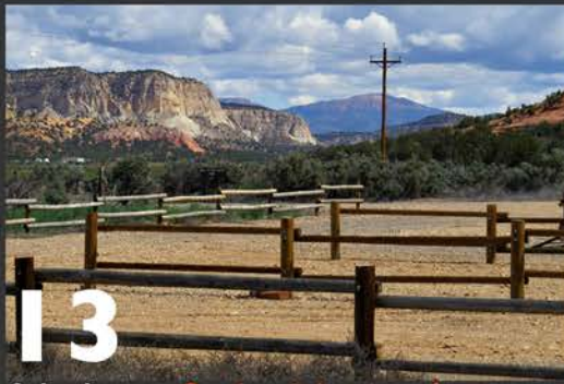
13 9.1 mi On the right: Nephi Pasture 4WD Trailhead