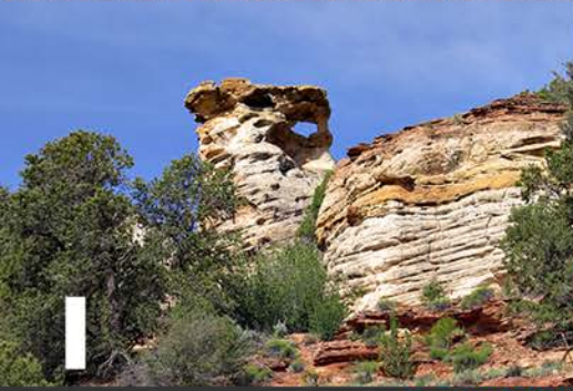
2.6 mi On the left: "The Lion's Head"