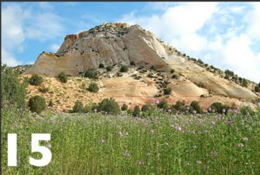
15 11.8 mi On the left: Swapp Canyon