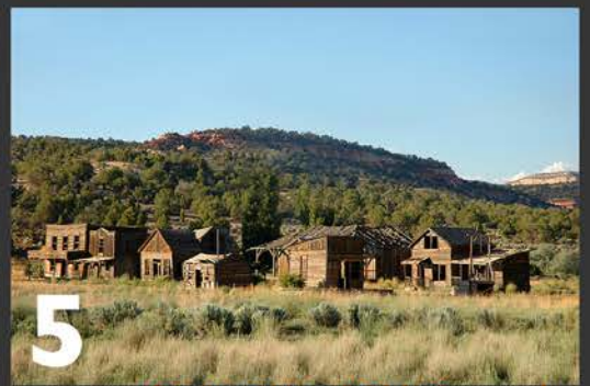
5 5.4 mi On the right: "Old Guns Smoke Movie Set" (1955-1975)