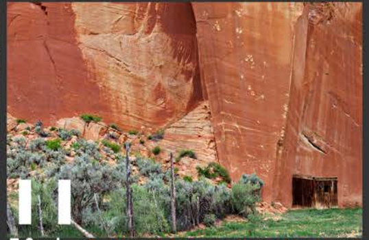
11 7.9 mi On the right: "Indian Writings" and "Cowboy Glyphs"