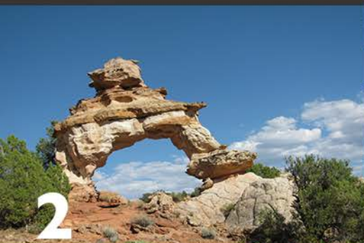
3.1 mi On the right: "Eagle Gate Arch"