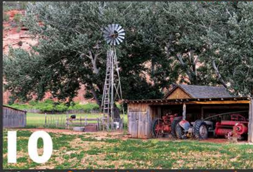
10 7.9 miles On the right: Bunting Ranches