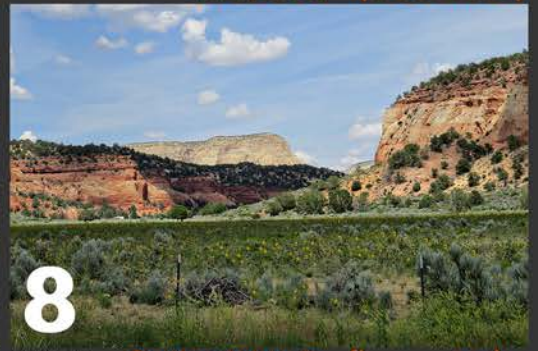
8 7.0 mi On the right: Sunflowers in the summer fields