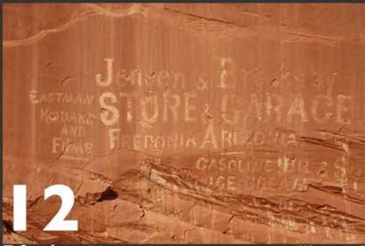
12 7.9 mi On the right: Pioneer Billboard and Indian Writings