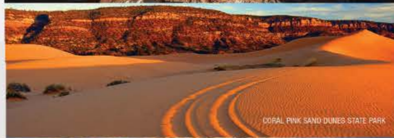
CORAL PINK SAND DUNES STATE PARK