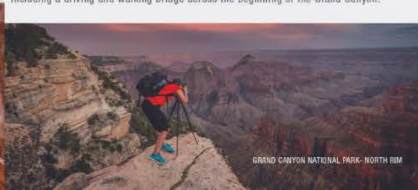
GRAND CANYON NATIONAL PARK - NORTH RIM